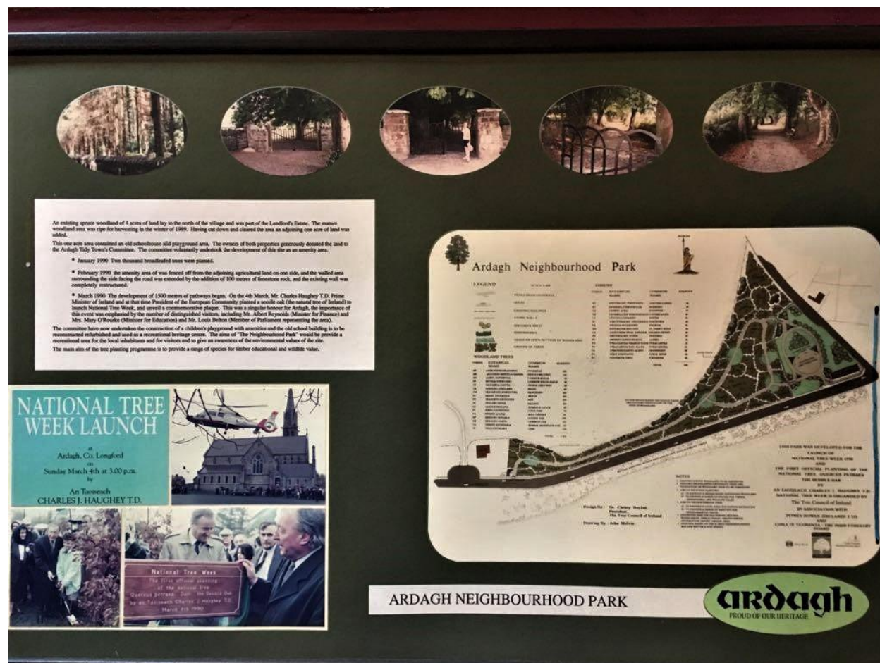
Photograph of Ardagh Neighbourhood Park information board located in The Heritage Centre