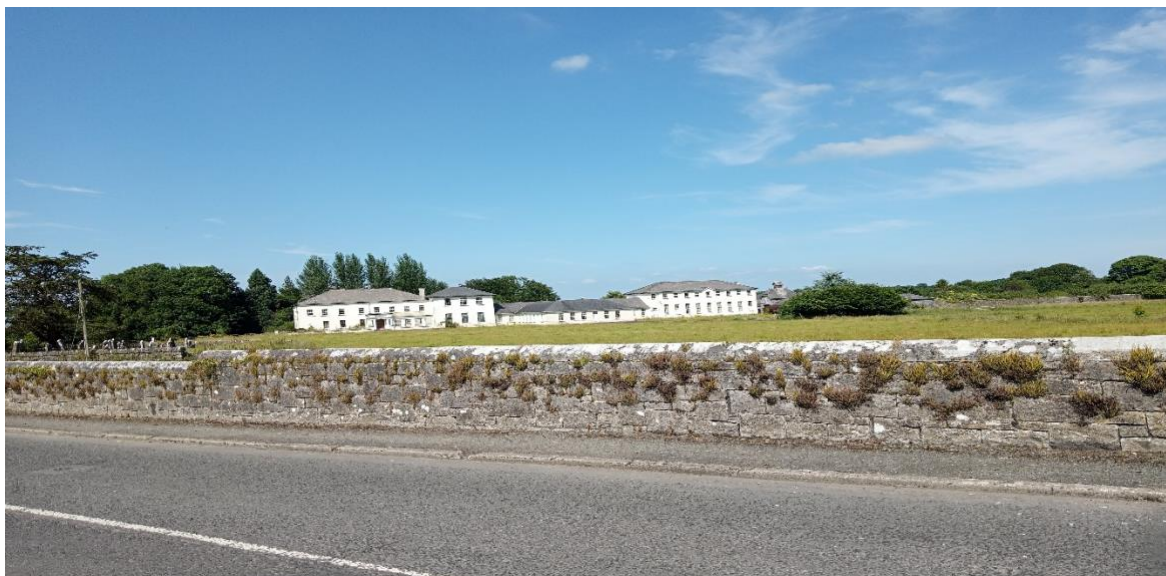
View of Ardagh House

It is a well known fact that Ardagh House, Demesne, and the structures of Ardagh Village are notable for the extent of their unique history. Ardagh Demesne has existed since 1703 and Ardagh House was first constructed in the 1730s. The current layout and (protected) structures of the village were planned and designed by James Rawson Carroll in the 1860s. The rarity of a planned village in Ireland is one of the factors for Ardagh being an Architectural Conservation Area. This holds a huge potential as a tourist attraction with generational benefits of preserving nature whilst creating much needed jobs which guarantees economic development to the Longford County.